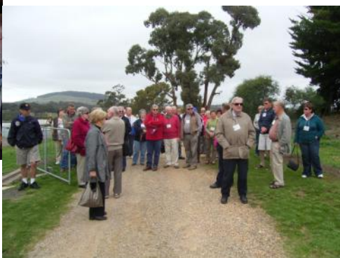
The red bus group at Cricket Willow - Photo by Alan Kinder