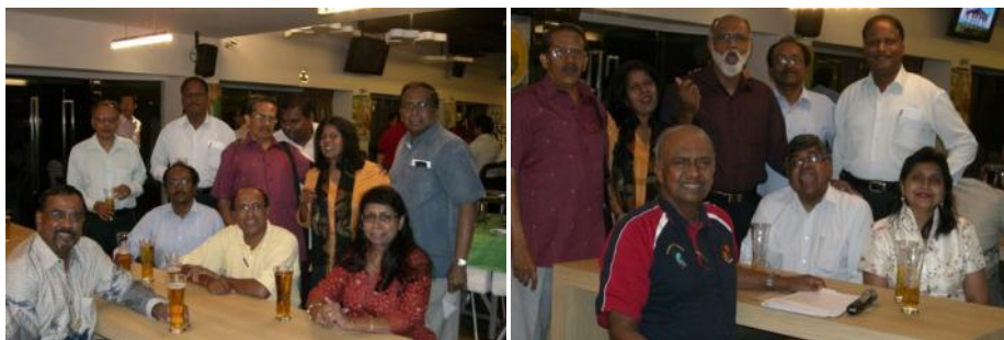
Members of Kelab Apex 40 enjoying themselves recently

In a similar vain, their next gathering was to be held at the Carlsberg Brewery, where beer would be ever flowing. Along with great food and music , the night sounds like it would have been a winner.