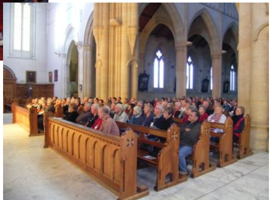
Special service at Sacred Heart Cathedral