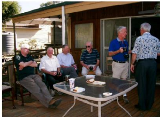
"Men's business" on the decking at the Hookey holiday house.