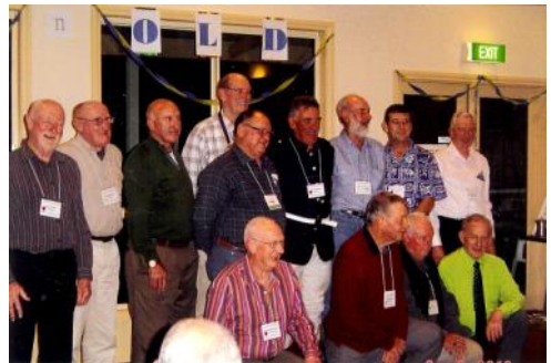
All the Presidents